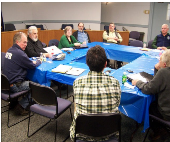
discussion of the Archive Project